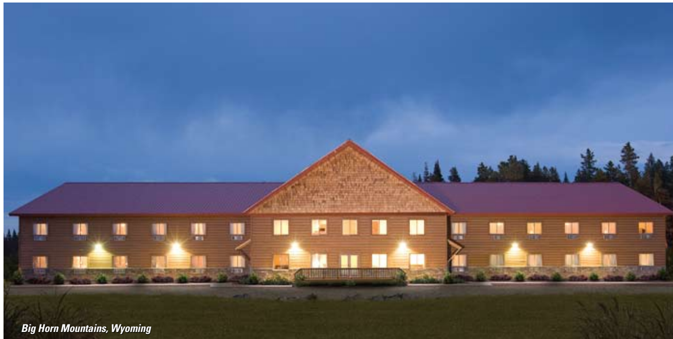
Big Horn Mountains, Wyoming

No matter what you build or where you build it, Genesis modular construction can help you built your resort faster, better and smarter.