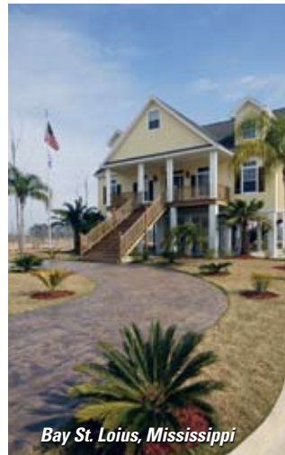
Bay St. Louis, Mississippi