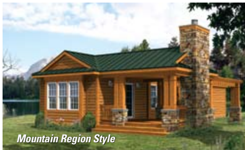
Mountain Region Style